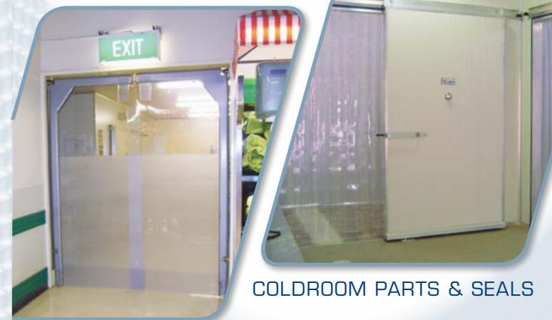
COLDROOM PARTS & SEALS

MANUFACTURERS AND SUPPLIERS OF QUALITY PRODUCTS